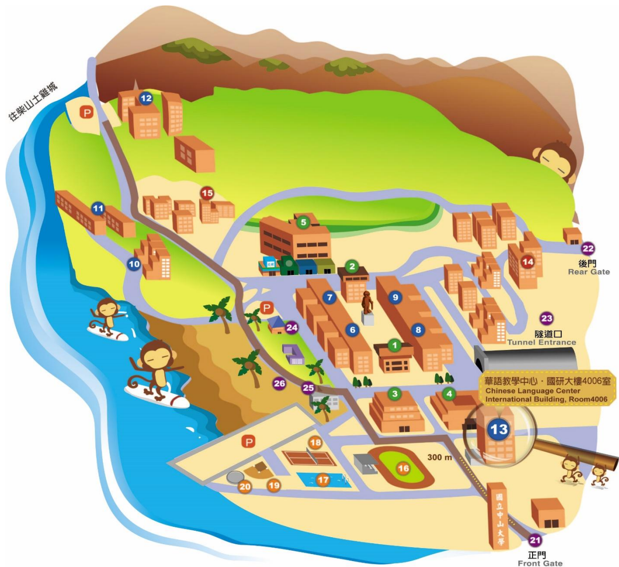
國立中山大學華語教學中心位置圖 Location of Chinese Language Center, NSYSU